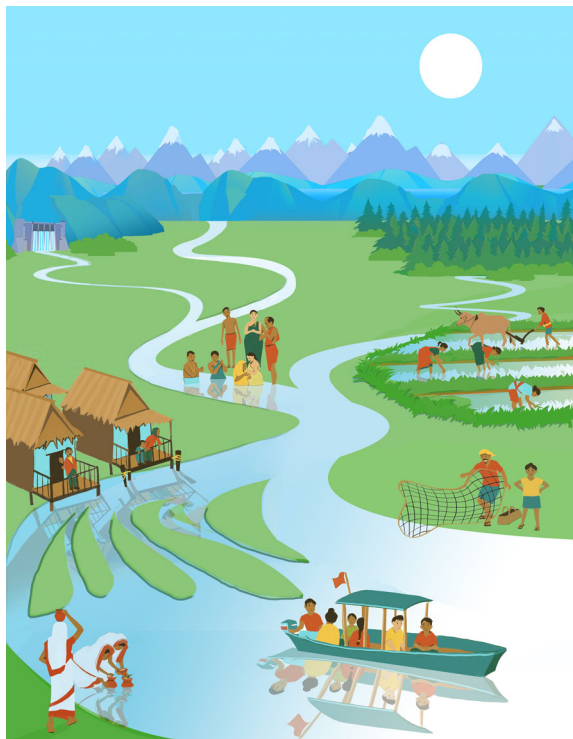
FIGURE 4 For many human populations around the world, river flows are linked to livelihood, identity, sense of place, religious beliefs and ceremonies, language systems, or educational practices. These embedded, reciprocal, and constitutive relationships between humans and rivers remain poorly understood, but can be critically important to assessment and implementation of environmental flows

additional factors or dimensions that need to be incorporated in the biophysical framing of environmental flow assessments. In this prevailing framing, alternative (nonmodern) ways of engaging with, talking about, living with and indeed defining and knowing rivers are relegated to the realm of “culture.”