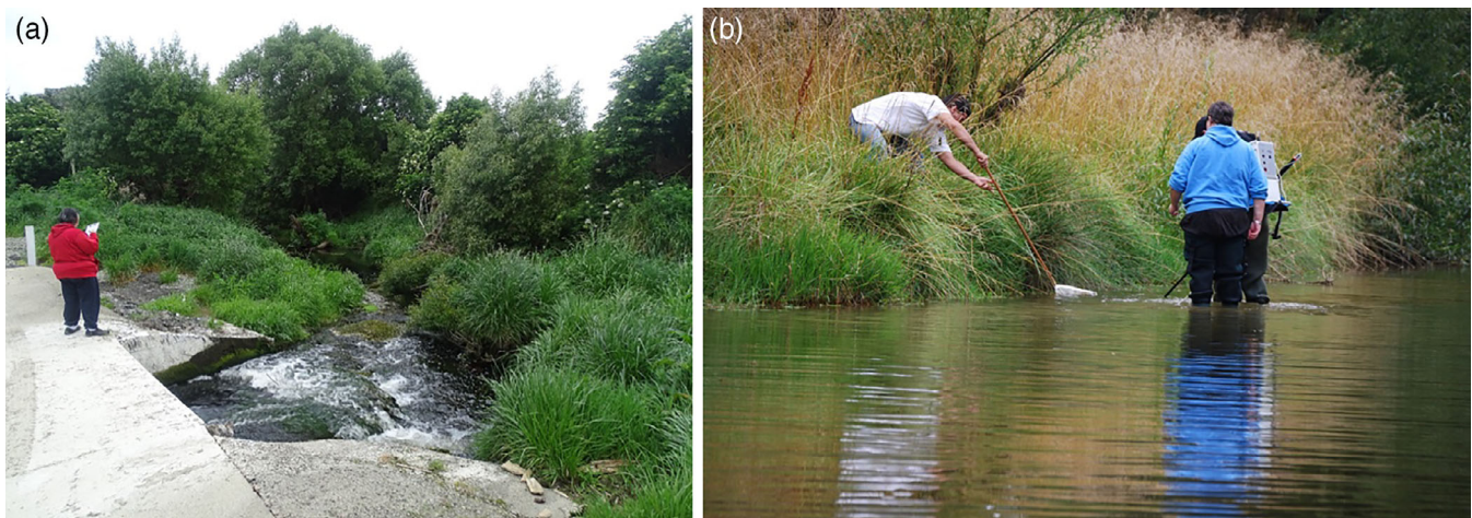
FIGURE 3 (a) A tribal member completing a cultural assessment of a tributary of the Kakaunui River, New Zealand. (Photo: Kyle Nelson). (b) As part of the Kakaunui Cultural Flow Preference Study, tribal members chose to complement their cultural assessments with data about eel presence, collected through electrofishing (Photo: Myra Tipa)

We describe results of CFPSs in the Kakaunui and Orari river catchments in New Zealand (Tipa & Nelson, 2012a, 2012b). Through field visits, structured assessments, and observations, average scores for various flow attributes and for each of the four themes (i.e., Wai Maori, Cultural Landscape, Cultural Use, and Hauora) were determined at several sites in each catchment. These average scores were compared with average recorded river flows for the time and date of the assessment. Additional data were collected using experiential study methods, specifically personal interviews with tribal members, focus groups, the use of pictorial information, open ended questions, and cognitive mapping.