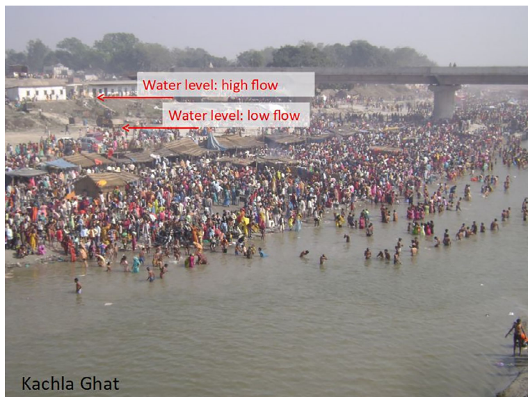
FIGURE 2 Flow needs for religious and spiritual practices were central to an environmental flow assessment for the Ganga River, India. Here, a gathering of pilgrims for the Kumbh festival.

allocate an additional 200–300 m 3 /s for the two-month duration of the Kumbh festival (Lokgariwar et al. 2014). During 2013, monitoring efforts showed that recommended water levels were maintained for more than 90% of the festival's duration. To the best of our knowledge, the Ganga River case was a world first in giving the spiritual status of a river the highest priority for determination and implementation of environmental flows. The magnitude and importance of the celebration of the Kumbh in 2013 called for action on environmental flows, and presented an opportunity to highlight the conservation challenges facing rejuvenation of the larger Ganga Basin (WWF, 2017).