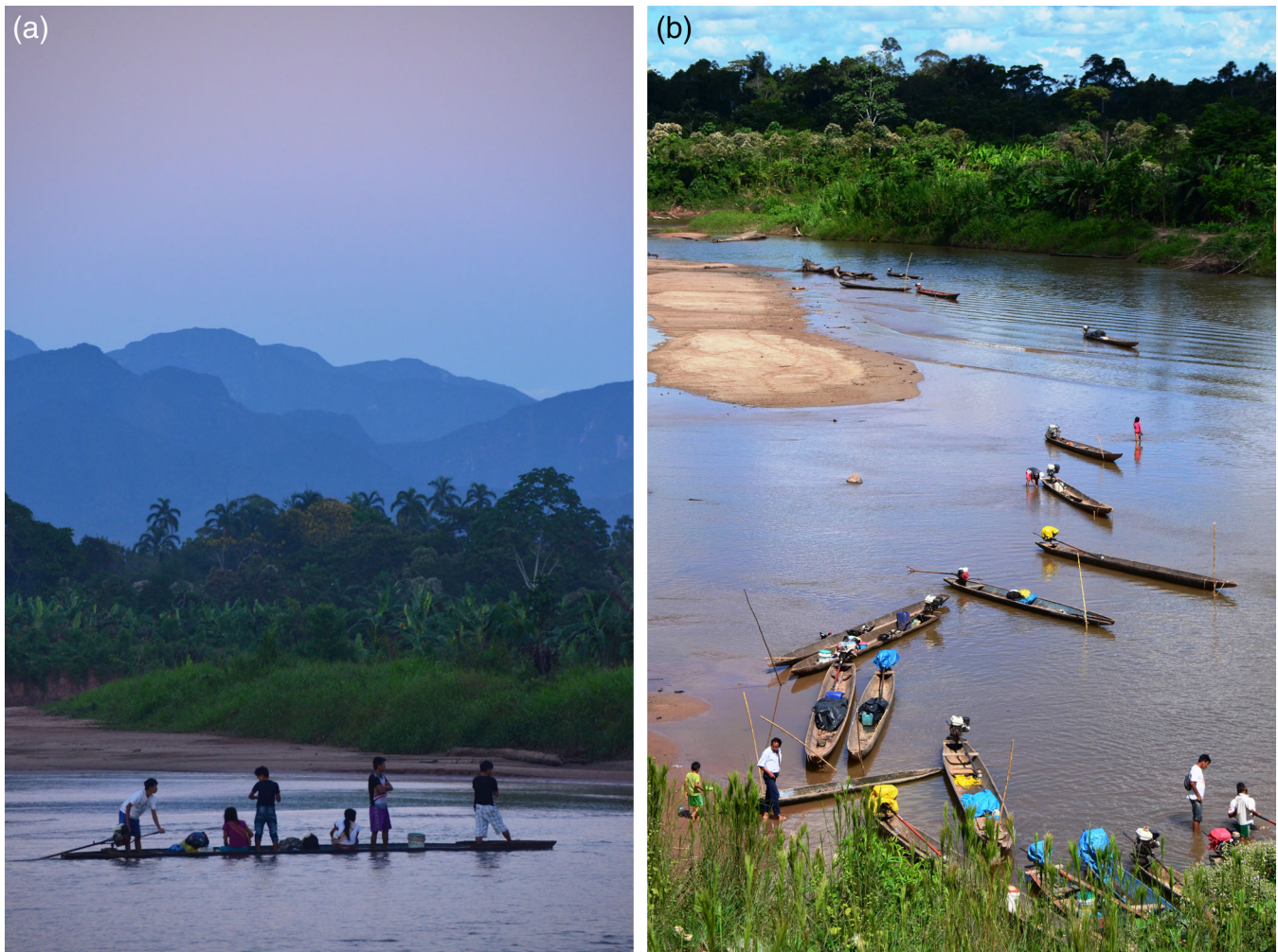
FIGURE 1 (a) The lives and livelihoods of people across the Amazon are inextricably linked to seasonal fluctuations in river flows. Rivers are also a key component of the culture of many Amazonian Indigenous groups, such as the Shawi (pictured here). (b) Rivers offer spaces, goods, and functions that mediate social interactions. Here, a gathering of canoes in the Peruvian Amazon.

such as floodplain fisheries, but also the less visible and generally less easily quantifiable values of rivers in water resource allocation frameworks. Additionally, the selected cases offer a lens for a better understanding of power relations among stakeholders and the importance of trust in supporting and developing dynamic relationships between humans, river flow regimes, and aquatic ecosystems, through relationships that are sustainable, just, and inclusive.