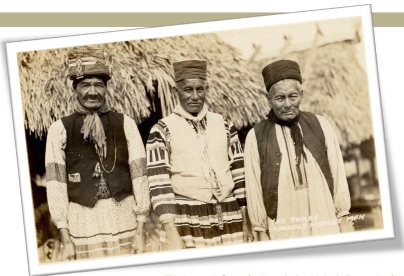
This image is from the Everglades Digital Library, Reclaiming the Everglades collection. http://everglades.fiu.edu/reclaim

493 new photographs have been added to the Coral Gables Memory collection from the archive of the City of Coral Gables Historical Resources Department.