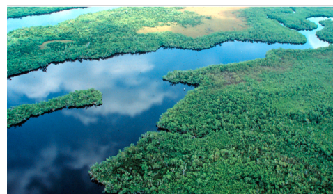
Aerial photo of SRS-4, Shark River Slough