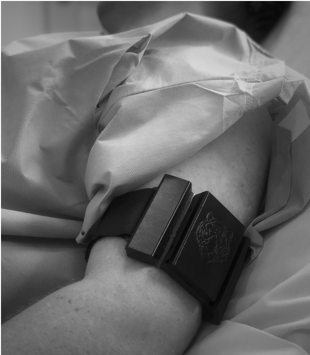
FIGURE 1. The Warfighter Monitor measures heart rate and heart rate variability from a single limb electrocardiogram.