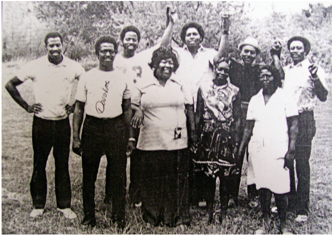
Figure 1. Norris Community Club, circa 1974

I begin with NCC, especially the ways in which the circulation of everyday, mostly ephemeral "mundane texts" (Rivers and Weber) provided a local channel