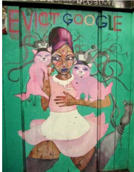
Fig. 1 Artist Carina Goldblatt’s mural shows a magenta-haired, Brown woman, whose facial features evoke calavera iconography, in a pink maid’s outfit holding two pink dog-like pets. She seems to be trying to run but is constrained by a rope wrapped around her right ankle. Above her head are the words “evict,” its letters dripping and red like blood, and “Google,” in in blue, red, yellow, and green letters like Google’s logo.