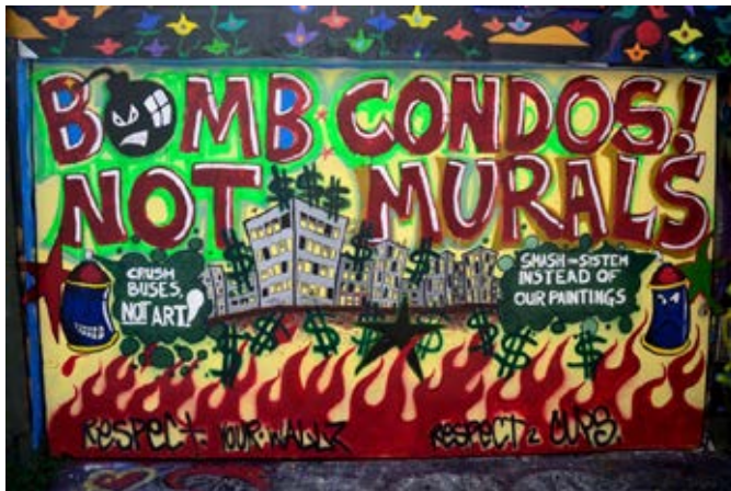
Fig 2: A mural with “Bomb Condos! Not Murals!” in red letters; a bomb with a face replaces the first O. Below this is a row of gray buildings bordered by dollar signs. On each side of the buildings is a blue, personified spray paint can: one sprays the phrase “crush buses, not art!”; the other, “smash the system instead of our paintings.” The mural’s lower edge has the tag “respect your wallz | respect cups” atop red flames.