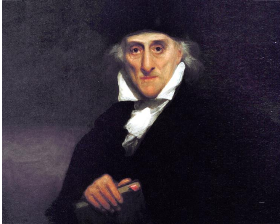
Example 3. Portrait of Lorenzo Da Ponte, ca. 1830, attributed to the American painter and inventor of the telegraph, Samuel F. B. Morse (1791–1872).

acknowledge his existence but to denigrate his character and his talent, asserting that the operas owed their greatness exclusively to the brilliance of the music. Mozart's genius, it was argued, compensated for the poetic weakness of the texts and the moral failings of the characters and plots—the latter, especially in the case of Così fan tutte , always an easy target. 22 These blemishes were understood to be the inevitable product of the unscrupulous, untalented librettist's Semitic race.