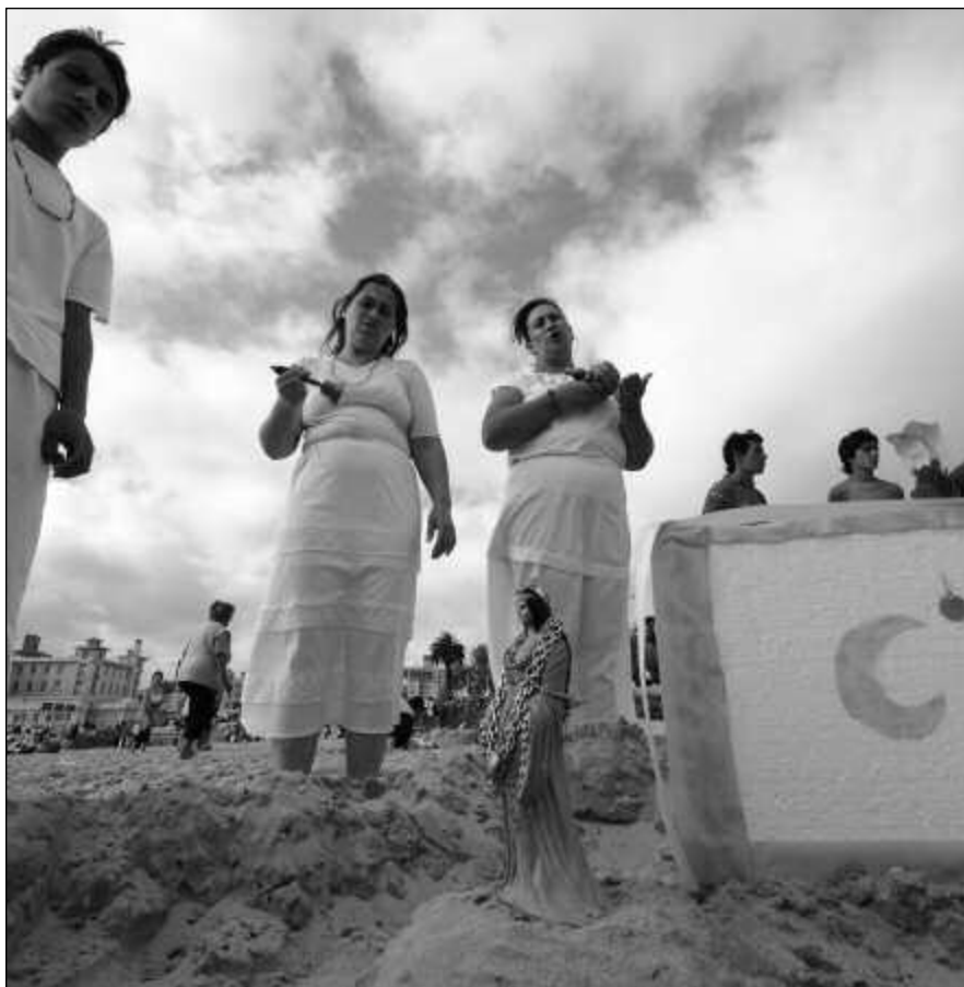
Devotees of the Afro-American Umbandista religion prepare an offering during the celebration of Iemanjá, the African goddess of the sea, in Montevideo, Uruguay.

who say they believe in God but are not affiliated with any institutional religion. This group accounts for 7.3% of Argentines and as many as 23% of Uruguayans.