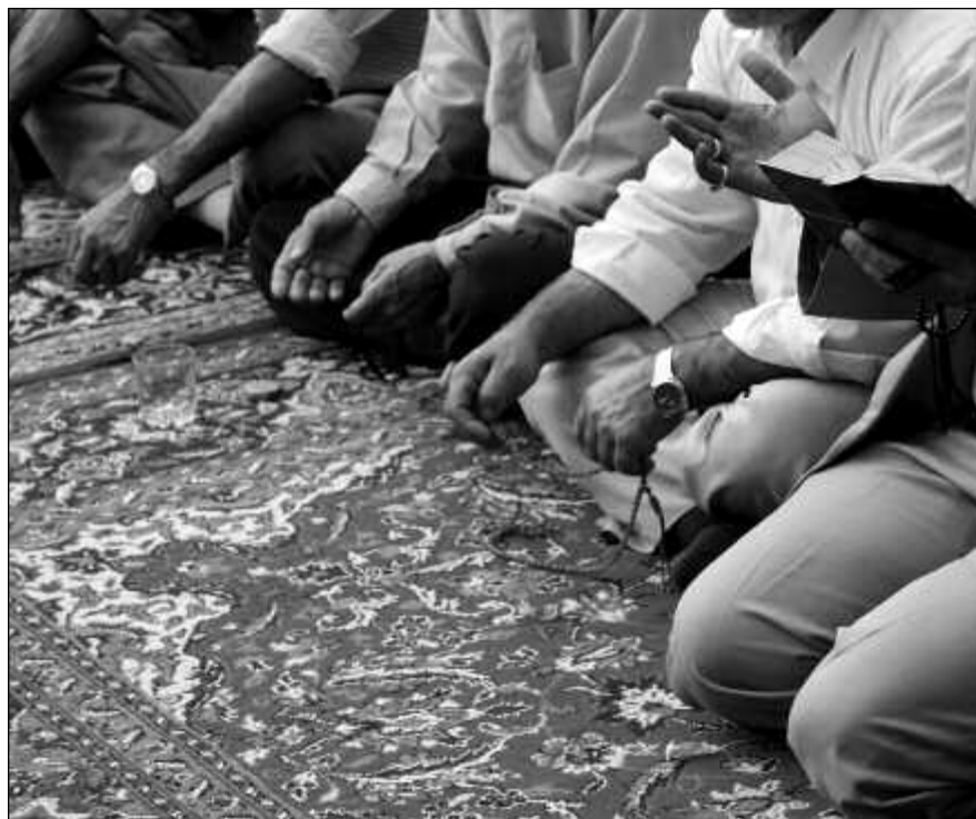
A group of Muslims pray at the Al Imam Ali Eben Abi Taleb Mosque in the city of Curitiba in southern Brazil.

Although academic research on this subject is starting to question