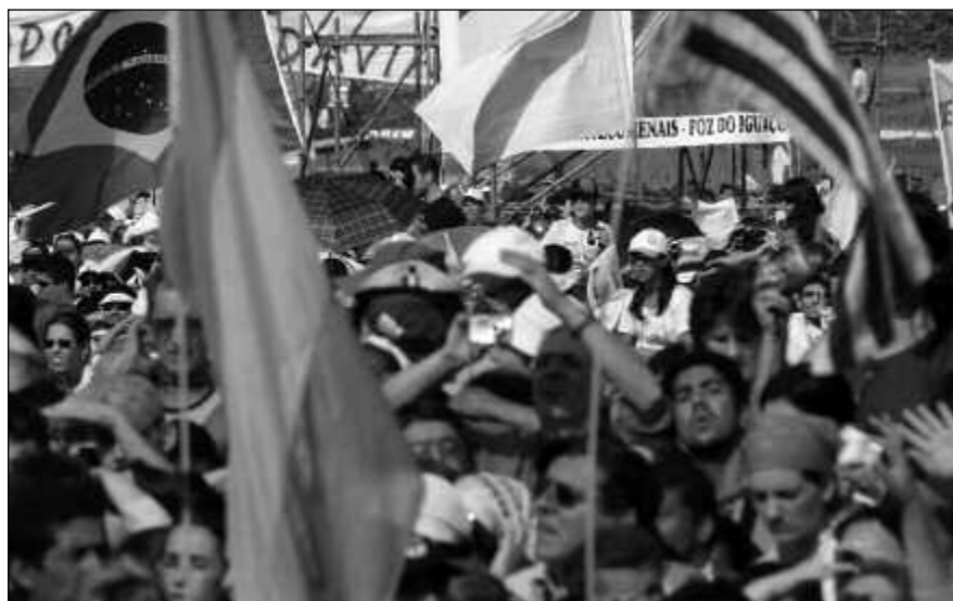
The faithful wave flags of South American countries as Pope Benedict XVI presides over Mass, opening the 5th general meeting of CELAM in front of Brazil's most famous shrine in the city of Aparecida.

In the period preceding Aparecida, the world that Catholic leaders saw