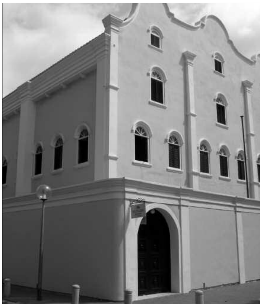
The Mikve Israel Synagogue on the Dutch island of Curaçao is the oldest Jewish house of worship still in use in the Americas.

a movement that could express the national realities of different countries, as Leonardo Senkman notes, Orthodox congregations have little use for national considerations in the construction of their identities. In