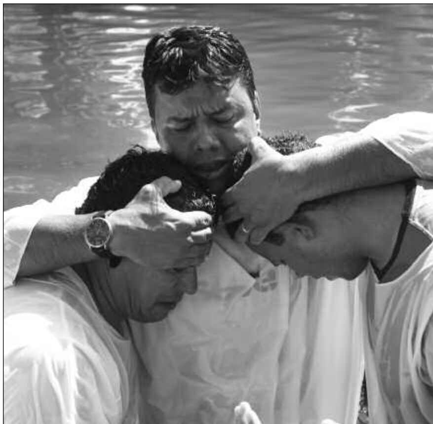
Brazilian Evangelist Christians pray during a ritual group baptism.

The fastest growing religious movement in Brazil and the rest of Latin America, Pentecostalism has its base in poverty and urban centers, at the bottom of the socioeconomic pyramid. Its followers tend to have little education and earn the minimum wage (465 reais, or US$230 a month) in jobs as domestic help or other unstable occupations. It attracts more women than men and more black, mixed race and indigenous people than whites. With rare exceptions, the middle classes shun Pentecostalism, whether out of moral conservatism or sectarianism.