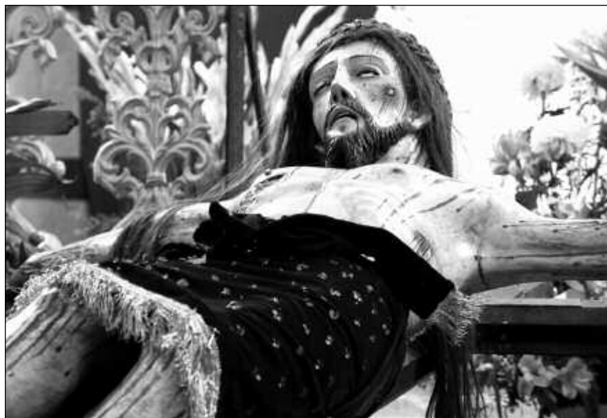
This 19th-century polychromed wooden statue of Christ—Cristo Calvario—is still used in religious processions in the city of Guanajuato, Mexico.

The uneasy relationship between church and state continues in the twenty-first century. The conservative government of President Vicente