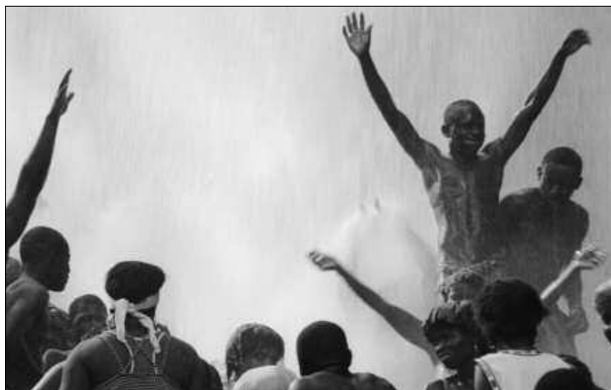
Pilgrims gather for ritual bathing at the Saut d'Eau waterfall near the village of Ville Bonheur in central Haiti. The pilgrimage to the waterfall takes place each year in July to commemorate the appearance of the Virgin Mary at the site. The tradition mixes Catholicism and elements of the voodoo religion.

Two among the new religious movements that we have just men-