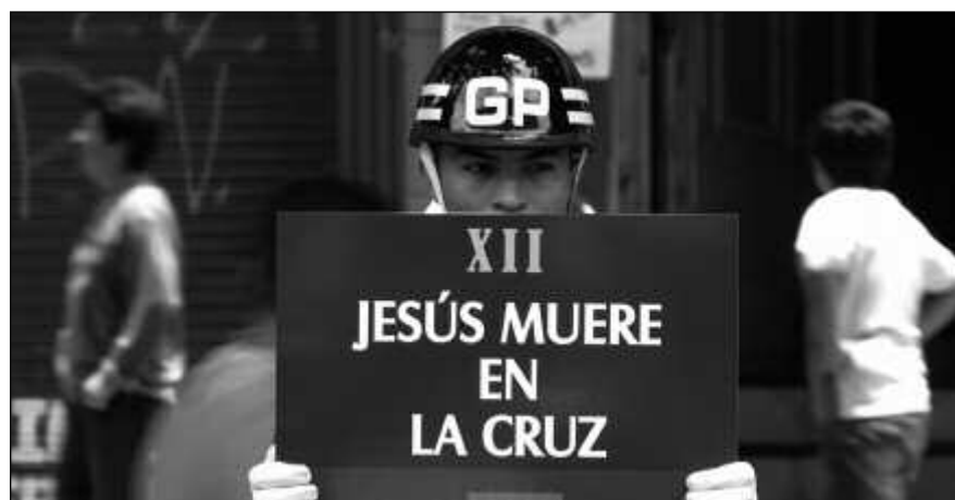
A Colombian soldier holds a placard which reads 'XII - Jesus Dies on the Cross,' indicating the 12th station of the Cross, during the Good Friday procession along the streets of Bogotá.

During the period of Liberal radicalism, Presbyterians were called from England to breakdown the Catholic hegemony. By the end of the nineteenth century, Colombia was home to a number of Christian churches and even some Protestant missions. Initial Protestant missionary efforts were not widely successful and in some areas there was no clear distinction between Protestants and Catholics, due to poor Catholic cate-