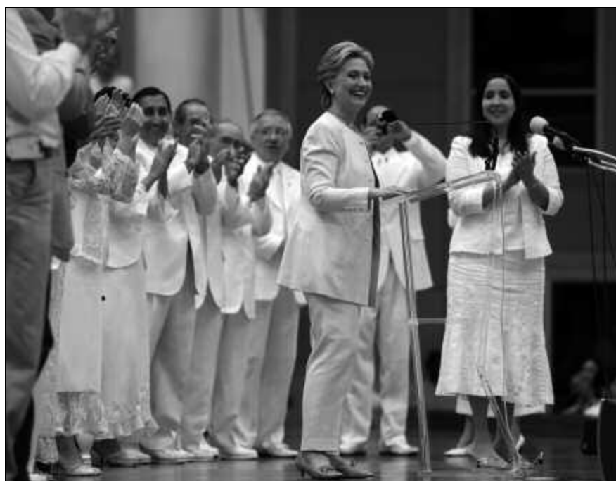
Then Democratic presidential hopeful U.S. Senator Hillary Clinton speaks to members of a Puerto Rican Pentecostal congregation in San Juan, Puerto Rico, during the 2008 presidential campaign.

The youthfulness of the Latino population, however, contributes to the discrepancy between its absolute numbers and voting capability. A full 34% of Latinos are under the voting age of 18 and 26% of those who are of age are not US citizens. Sixty percent of Latinos, therefore, are ineligible to vote, compared to