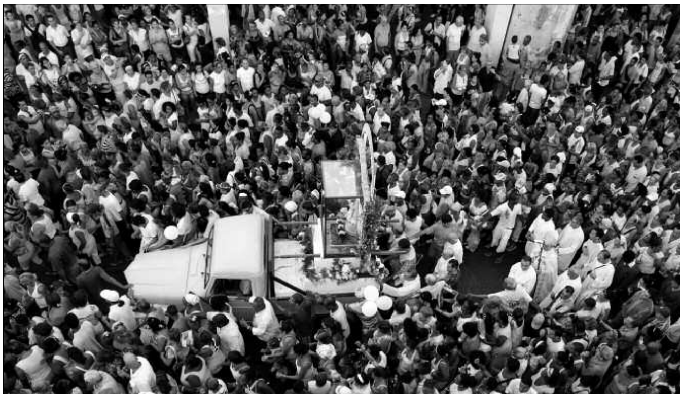
Hundreds of followers and devotees of Cuba's patron saint La Virgen de la Caridad del Cobre take part in a procession during celebrations in Havana.