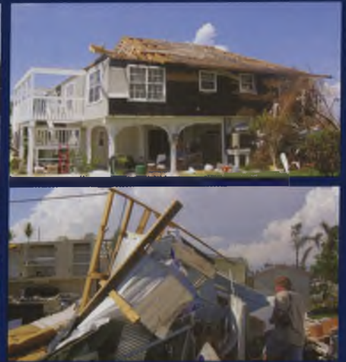
FIU researcher Forrest Masters captured these images of damage throughout Florida after the 2004 hurricanes.