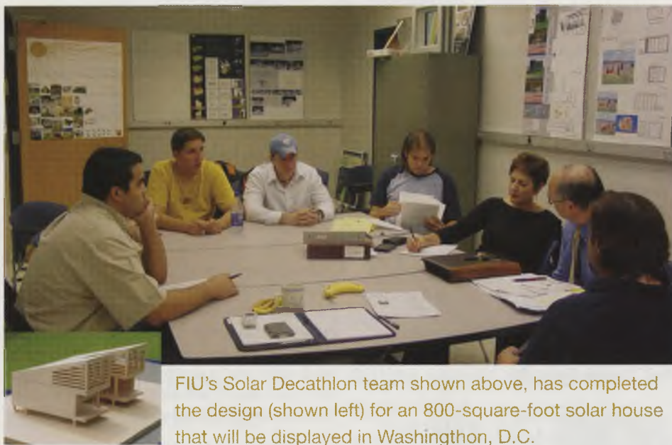
FIU's Solar Decathlon team shown above, has completed the design (shown left) for an 800-square-foot solar house that will be displayed in Washington, D.C.