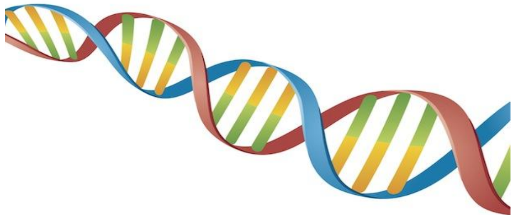
Figure 1. The DNA double helix

During the copying process, with the base pairing principle in mind, a perfect DNA copy in each daughter cell can be achieved. Each cell has six billion base pairs; therefore, if adenine (A) will always be paired with thymine (T), the chances of error are lessened drastically in the copying process. Furthermore, the DNA is not copied within the nucleus but within the cytoplasm of the cell. Triplet nucleotide bases of DNA correspond to an amino acid, which is in fact a protein base. Therefore, the triplet nucleotide bases of cytosine (C), adenine (A), and guanine (G) corresponds to the amino acid glutamine, or thymine (T), adenine (A), and thymine (T) will correspond to the amino acid tyrosine (Moore 30). These protein bases are given their shape by the amino acids, which only match according to gene sequence triplets. Therefore, the protein shapes are ultimately influenced by the DNA sequence. In order for these proteins to be created and for information from the DNA to be read within the cytoplasm, the information must be copied to another similar molecule called the RNA. Ribonucleic acid