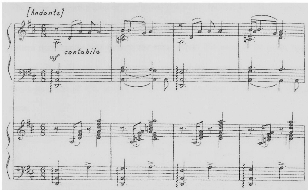
Figure 10. Arutiunian–Babadjanyan: Armenian Rhapsody for Two Pianos .

In the opening first 14 measures the melody is based on a pedal point. With modal changes that lead into a minor, the dance-like movement continues with a call and response from both pianos, keeping a steady dance accompaniment. The dynamics and the intensity of the piece grow, as the melody returns in the first piano in double octaves. A few subito piano markings impersonate the movements of Armenian dancers, who frequently raise their arms high, then with a sudden movement bring them down below their waists, while mimicking thoughts with expressive finger movement. The theme in the Andante is a call and response in itself, consisting of twelve measures, with three groups of two plus two measures. When the theme concludes in the first piano, the second piano repeats it in a slightly varied setting.