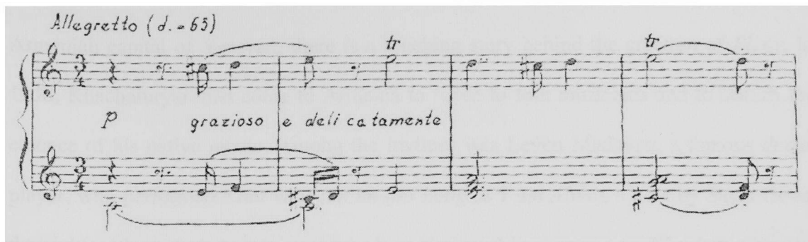
Figure 5. Tigranian: Rangi .