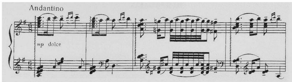
Figure 1. Andriasian: Yes Mi Kharib Blbuli Pes , opening.