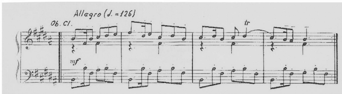
Figure 3. Armenian Folk Dance Darchni .

It is easy to recognize the similarity of the main theme in this piece with that of the Armenian folk dance called Darchni . See the following Figure 3: