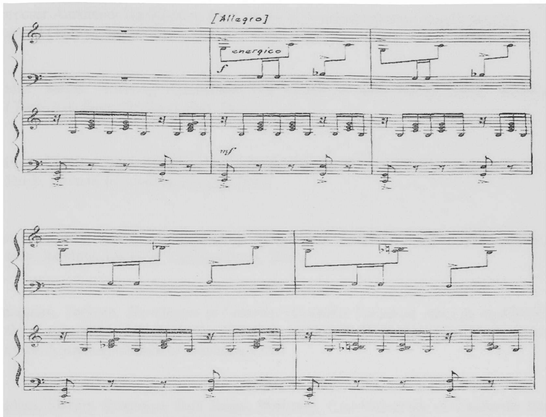
Figure 11. Arutiunian–Babadjanyan: beginning of the Allegro section.

The theme is heard a total of four times with a rich chordal and modal setting. The second half of the piece, Allegro, starts off with a dynamic crescendo and rhythmic pattern that literally lasts through the entire piece. The unusual 5/8 meter creates a chasing affect, in which the listener is captured by a web of rhythmic ideas, with single measures of 6/8, thrown in between the exchange of themes in both piano parts.