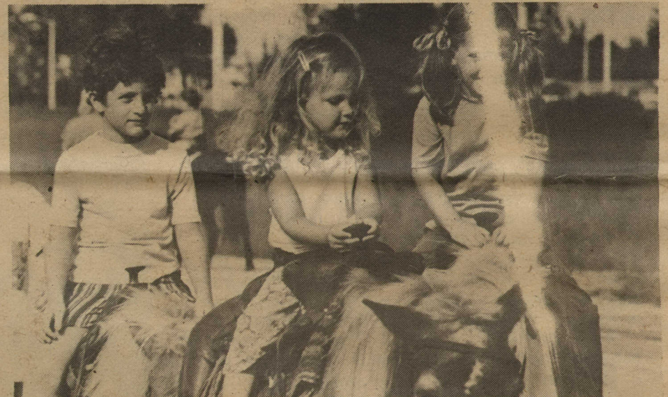
Kids riding ponies at a Fall Festival of the past.