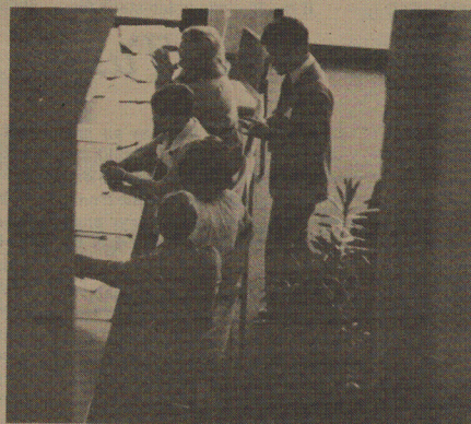
VOTING IN THE FIU LIBRARY