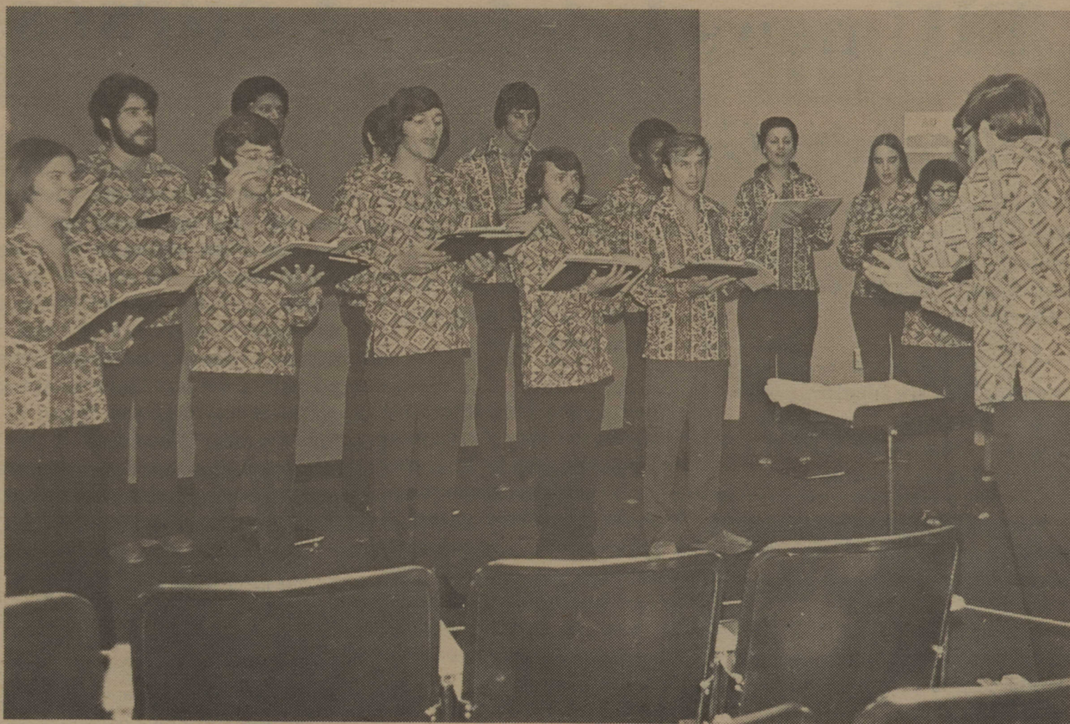
Collegiate Chorale performs Sunday at Bicentennial Kick-Off