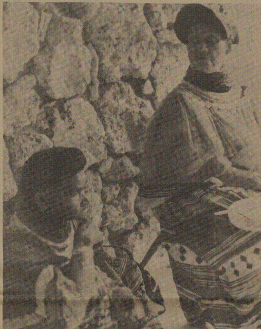
Miccosukee women make a vivid portrait of South Florida culture. The Indian world revolves in its own traditions and lifestyles, thirty miles west of FIU. GOOD TIMES salutes the tribe, and the Miccosukee students at FIU.