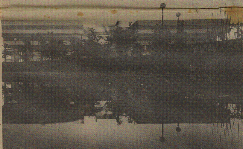
La Deuxieme Maison (DM) Building glows in its own reflection