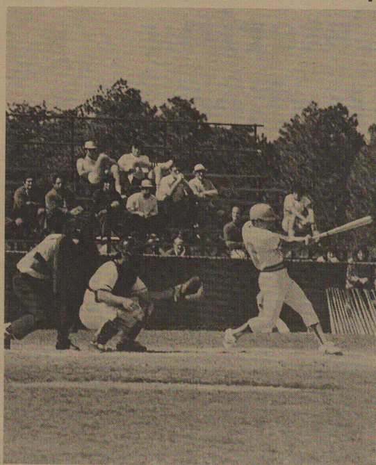
Ball cracks against bat as FIU Sunblazers compete at the diamond