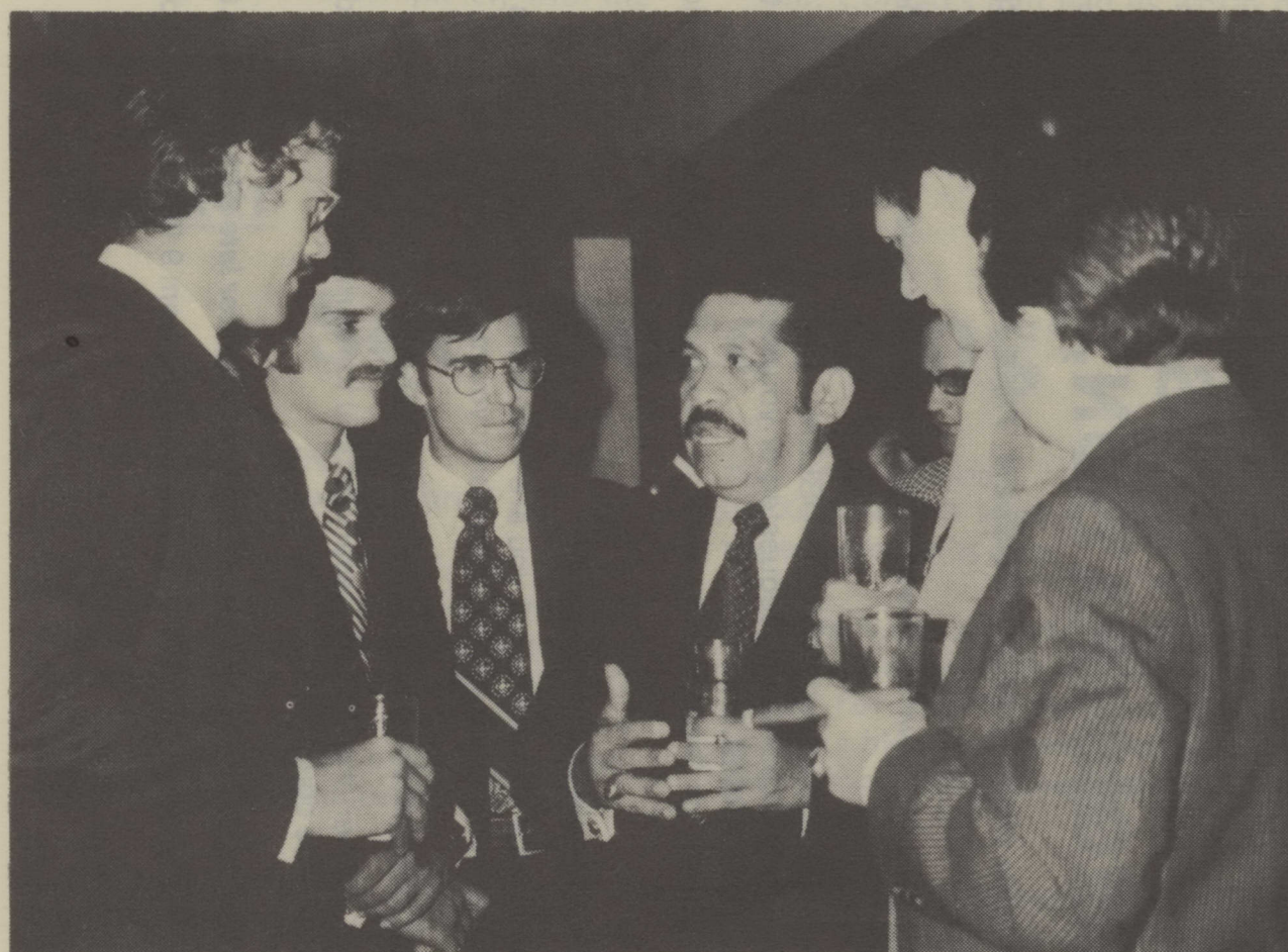
President Arturo Armando Molina talks to FIU students.

In hunting out these problems, the faculty and students from Florida have