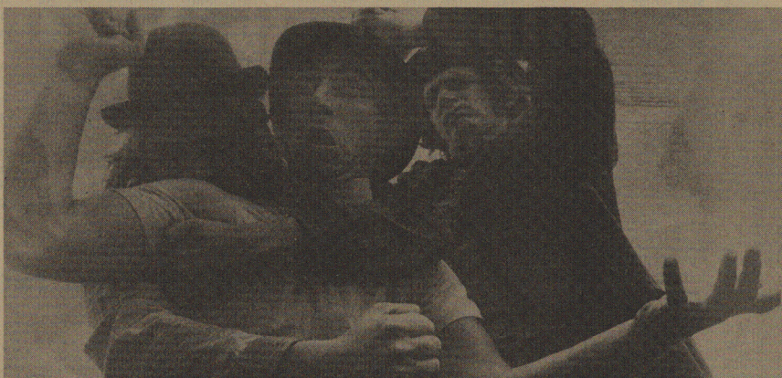
Estragon and Vladimir attempt to stop Lucky's thinking process

The most forward-looking play of our time, with the two "waiters" being Everymen rather than the aristocratic heroes of