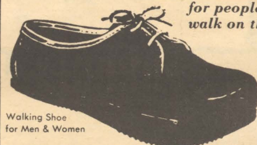
Walking Shoe for Men & Women

REGIONAL OFFICE (305) 944-5084 or 949-1033 SINCE 1938