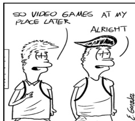
ERNESTO GONZALEZ/PANTHER PRESS