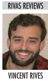
RIVAS REVIEWS VINCENT RIVES

Dubbed as “your muse’s favorite party,” The Void brings together artists of all mediums from around the city. Painters, graffiti writers, photographers and more filled the LMNT venue this past Friday. Rather than just curating different visual artists, The Void combines live musical performances, alongside the art displayed, creating a premiere party in the heart of the Wynwood area. The vibe at the Void can only be