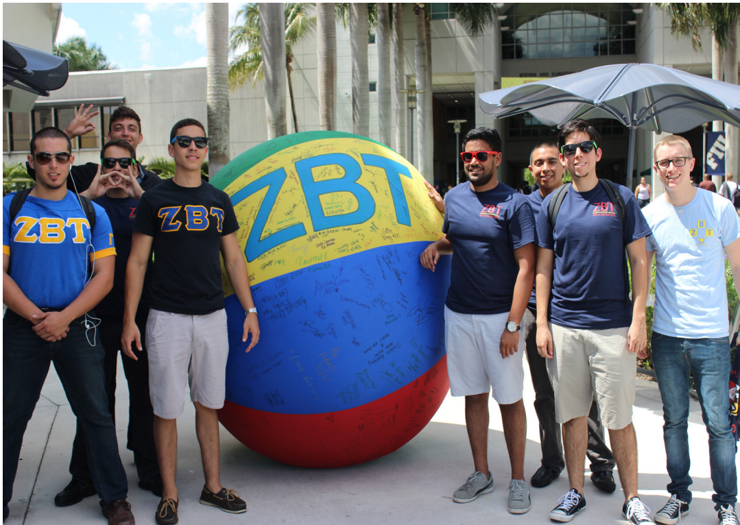
Members of the Zeta Beta Tau fraternity pose with their giant beach on the GC lawn on Tuesday, March 17.