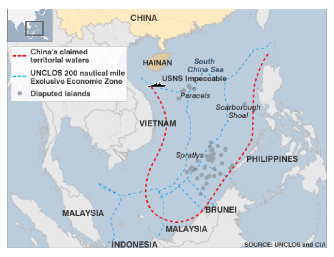
Figure 1.1: UNCLOS and CIA South China Sea Map

As part of the Pacific Ocean, the South China Sea goes from the Taiwan Strait all the way south to the Strait of Malacca. The region is economically important for a multitude of reasons, and not just to the seven countries already mentioned in the direct vicinity but also to countries that could be affected indirectly such as South Korea, North Korea, and Japan. These indirect actors are following the events on the ground, and will be significantly impacted by the actions that take place. The South China Sea is home to an abundance of biodiversity including fishes, which are vital for the Philippines. Fisheries are important for economic livelihoods, and also provide food for the table.