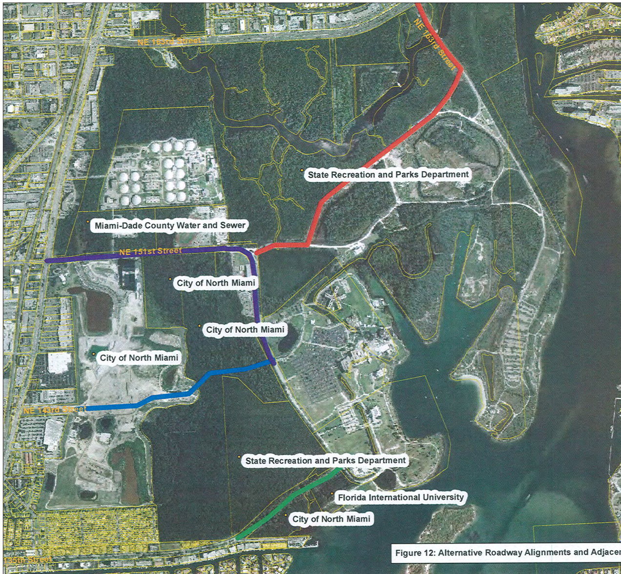
GRAPHIC COURTESY OF STEVE SAULS

“We are not actively looking at 135 street, although 135 street would be the least expensive and the least envi-