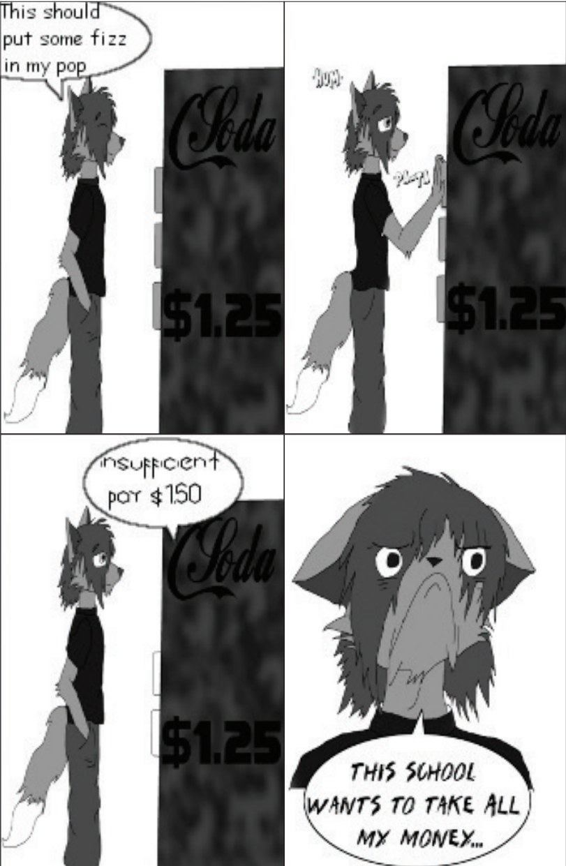
ILLUSTRATION BY GIOVANNI GARCIA/THE BEACON