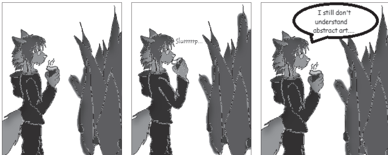
ILLUSTRATION BY GIOVANNI GARCIA/THE BEACON