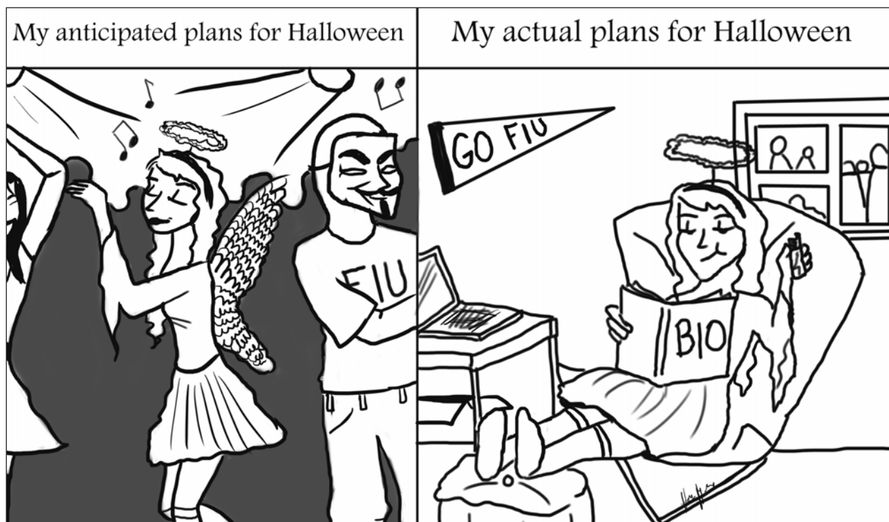
ILLUSTRATION BY HOLLY McCOACH/THE BEACON