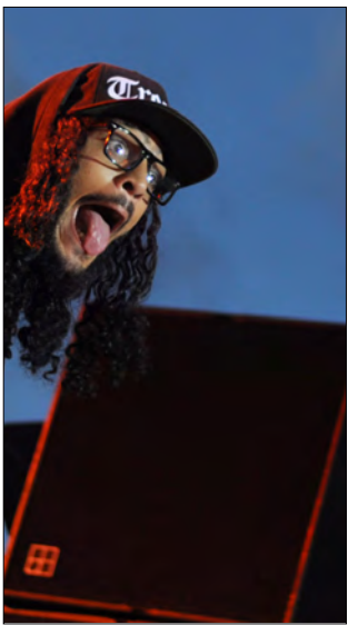
Big Sean [top left and bottom right] headlined at the UPRoar concert, the annual spring concert hosted by SPC. Travie McCoy, the lead singer for the Gym Class Heroes, entertained the audience as the opening act (bottom left and upper and middle right).