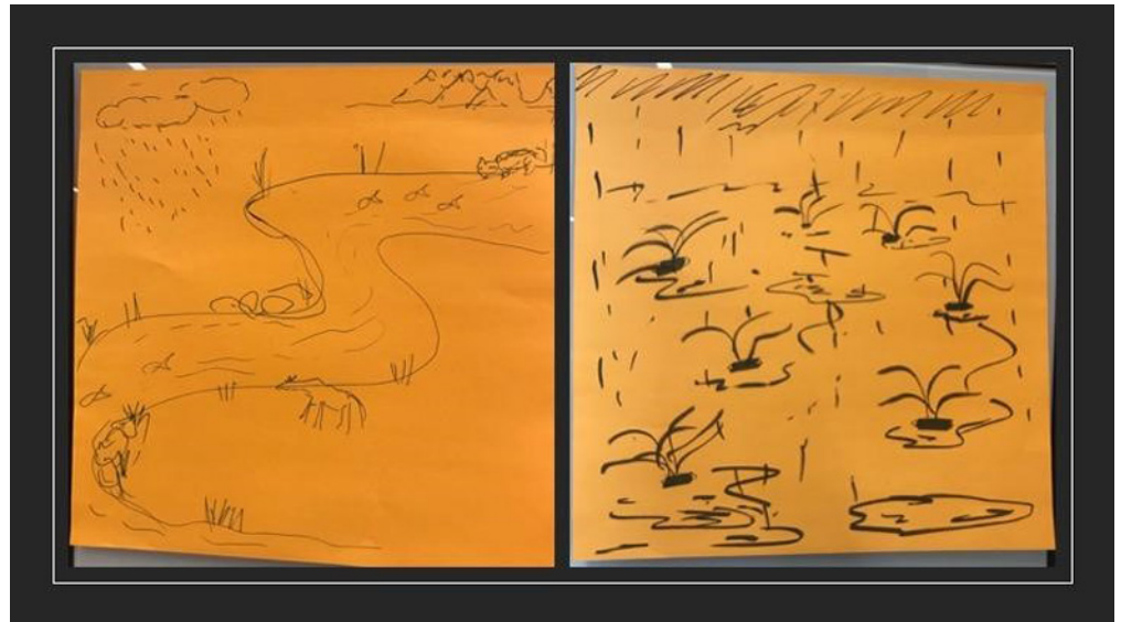
Figure 2 Images of Water Flourishing Without Humans

humans out of the picture. For them, the illustration of water flourishing meant prioritising the primary role, and the inherent rights, of human-less nature. In water flourishing, humans were no longer dominant or, perhaps, our reign of unrestricted carbon emissions had come to an end; either way, humans had somehow ceased to ‘mess things up’. Such a people-less view of environmental flourishing is common, as scholars have observed at least since the 1996 publication of William Cronon’s famous essay ‘The Trouble with Wilderness; or, Getting Back to the Wrong Nature’. 4