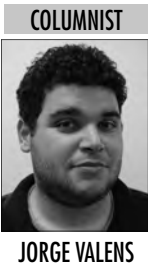
COLUMNIST JORGE VALENS

places your information is backed up. For example, all my information is primarily backed up on a hard drive that sits on my desk. Aside from this, I keep a mirrored pocket hard drive in my office desk that I plug in to and update once a week as well as using some light cloud storage for important documents I keep with me at all times. With a single cloud storage solution the average user can’t create that redundancy; they simply fork over their information and hope for the best. Fret not cloud inhabitants, there are a few options for you. If you use Google Apps and social media often, and take pride in the banal statements you tweet throughout the day, then services like Backupify are for you. The folks at Backupify specialize in backing up your social graph and Google Apps accounts. Their free entry-level package backs up five different accounts and gives users 2 GB of storage. They also offer a 20 GB plan for $4.99 per month and an unlimited storage option for $19.99 per month. For cloud storage to be taken seriously, providers like Google need to be more transparent when it comes to how they manage people’s information and the levels of reliability they can offer.