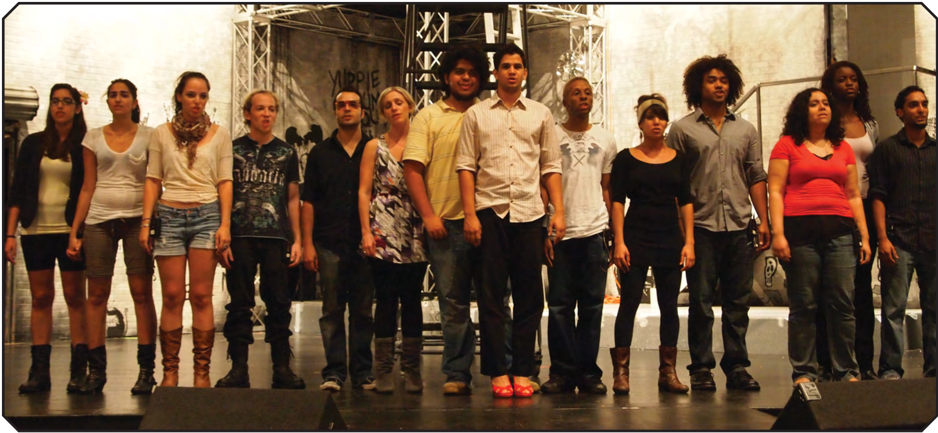
The cast of Rent during Crew View rehearsals on Oct. 28.