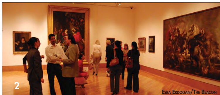
1. The Wolfsonian Teaching Gallery at The Frost Art Museum featuring La Habana Moderna . 2. Peter Paul Rubens' The Adoration of the Magi and Alexander's Lion Hunt . 3. La Habana Moderna is composed of 1940s memorabilia.