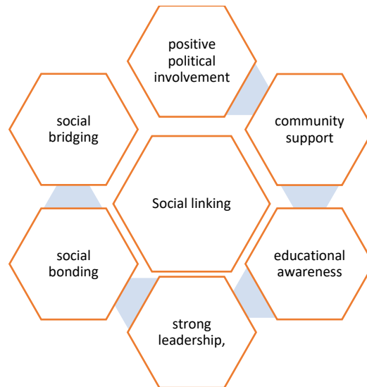
Figure 4.4 Thematic mapping of Leadership & Community role Word Tre