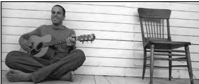
AP IMAGE EXCHANGE

3 Vampire Weekend No band in recent memory has inspired perhaps more collective shrugging than these guys. They essentially write music about going to Harvard that can conceivably be played at any dinner party once that AIR CD is finished. Oh, and there are tablas in some of the songs, too. None of these elements make for anything close to engaging because of the ridiculously specific audience they're pandering to.