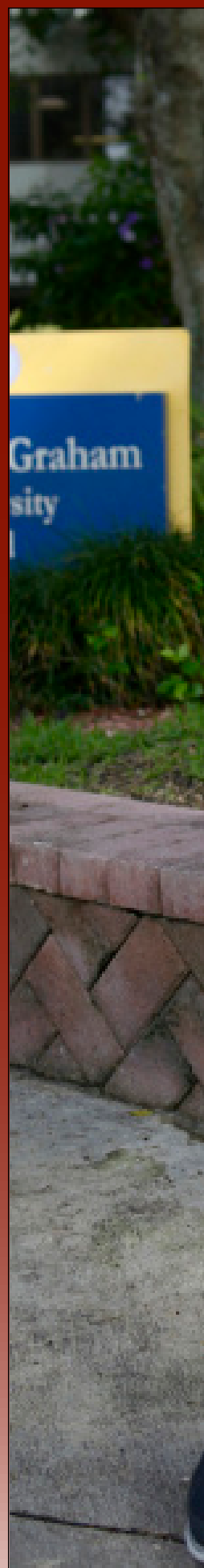
Defenders, an organization that focuses on systemic inequality.