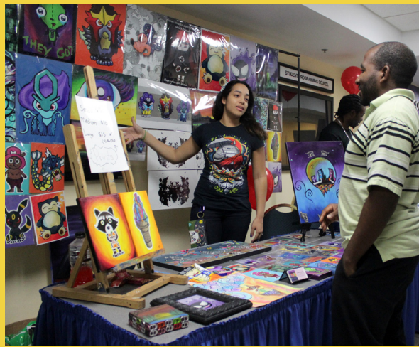
NAHUE REYES / THE BEACON