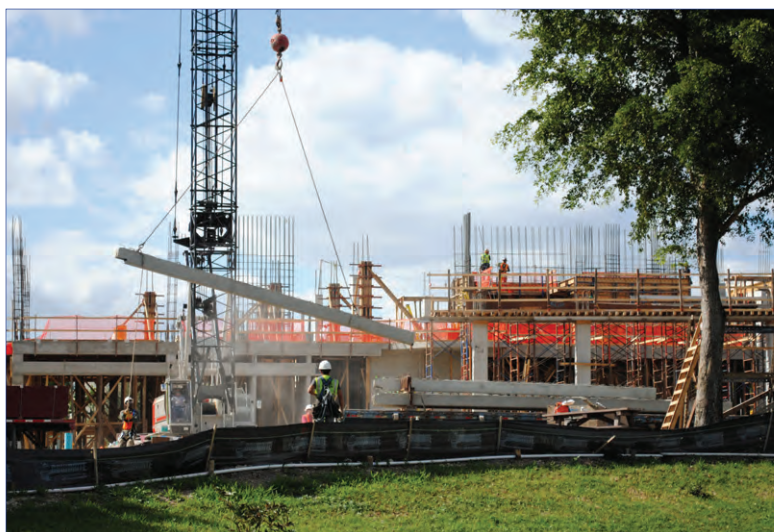
ABOVE: The construction for Parking Garage 5, behind the Chemistry and Physics building and next to the Red Garage, began at the end of the Fall 2009 semester. It will add 2,000 parking spaces, 1,500 of which will be available to students. The structure will contain 30,000 ft of retail space and will be the new headquarters for the FIU Police. The garage is set to open in August of 2010.