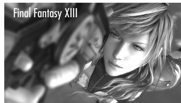
Final Fantasy XIII

The trailers for Team ICO's third game are some of the most graphically impressive things I've seen. The group's latest effort will likely bring more of the heartfelt story-telling seen in previous titles, Ico and Shadow of the Colossus, as the story of a young boy and his gigantic, furry guardian unfold.