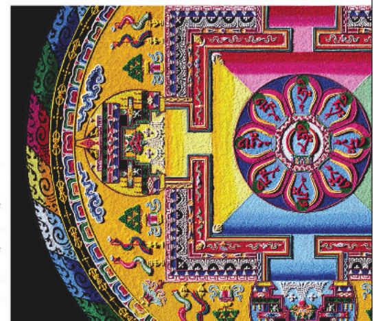
A Mandala created by the Monks of The Drepung Loseling Monastery on tour with the Mystical Arts of Tibet