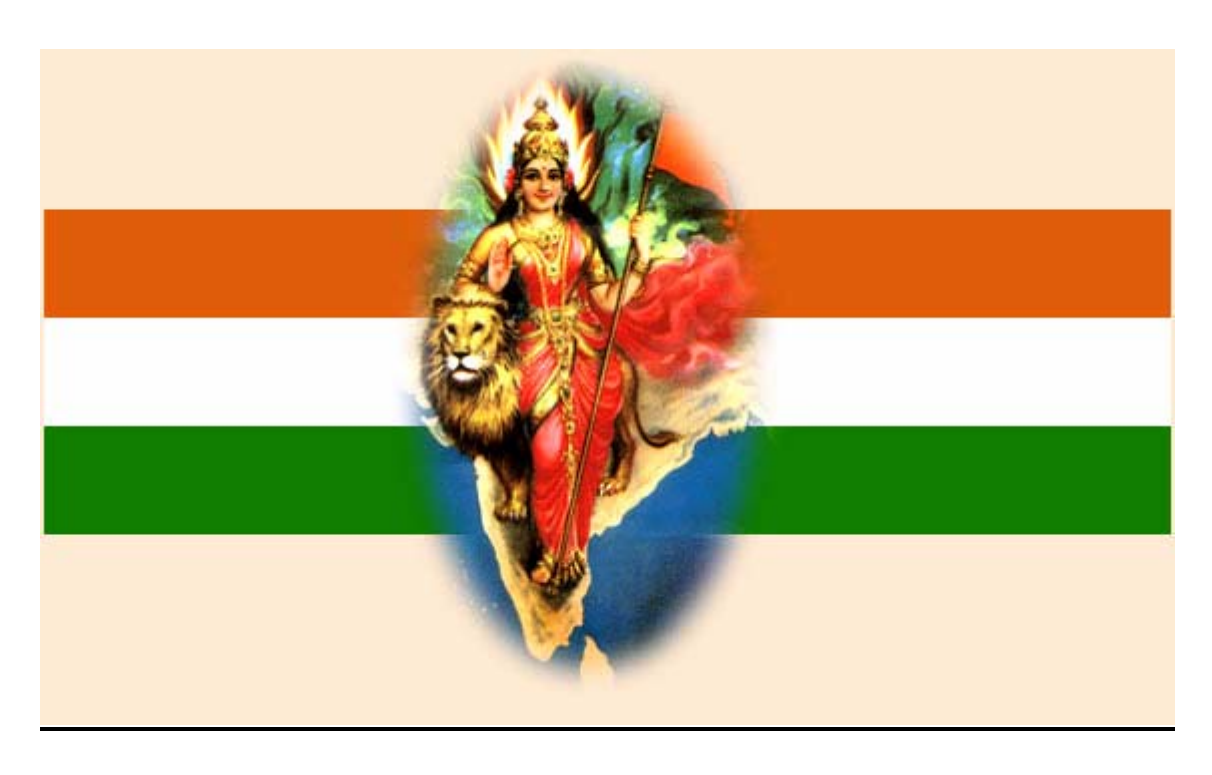
Calendar image found in BJP Office, New Delhi