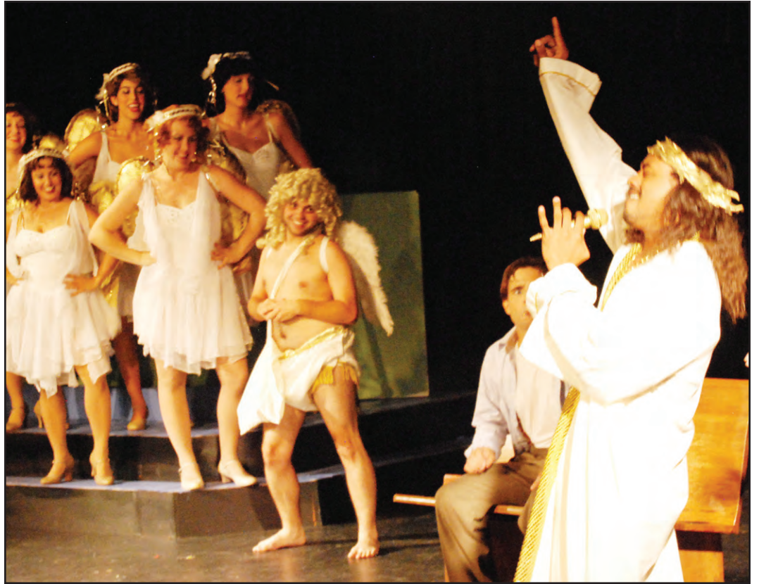
COURTNEY BAAS/THE BEACON