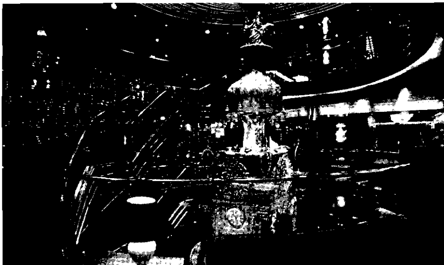
The atrium clock of the Rotterdam focuses attention of cruise guests.