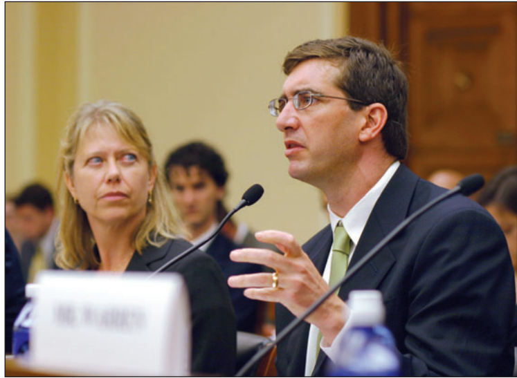
Figure 1. Scott Doney from the Woods Hole Oceanographic Institution (Woods Hole, MA) and an Aldo Leopold Leadership Program Fellow testifying before the US Congress.

University and college teachers are well aware that students are increasingly approaching environmental sci-