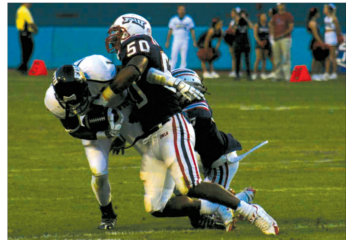
FAU 57, FIU 50

According to Dial, Housing and Residential Life will be looking up