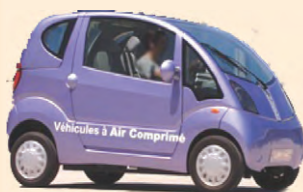
Mini FlowAIR: Three-seater compressed air vehicle (formerly known as the MiniCat): not in production as yet.