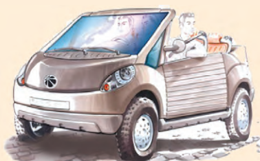
One FlowAIR: Economy/utility compressed air vehicle (formerly known as the OneCat): production in 2008.