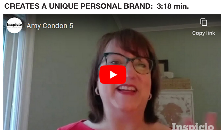
Bill Baggs' story would make a great movie. Is that on your agenda?