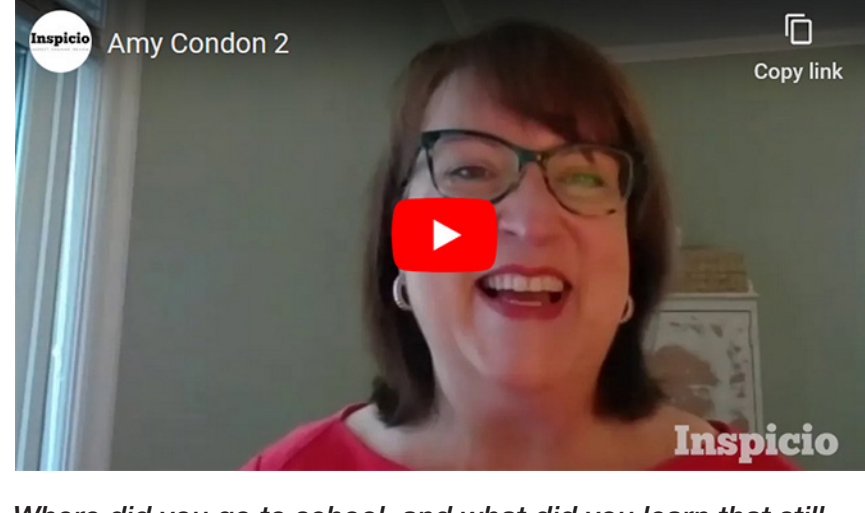
Where did you go to school, and what did you learn that still informs you today?