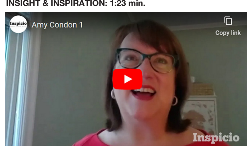
Where did you grow up and what was your first awareness of art of any discipline?