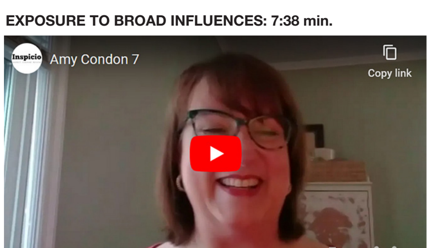
What were some of your favorite resources used to write “A Nervous Man Shouldn’t Be Here in The First Place”?