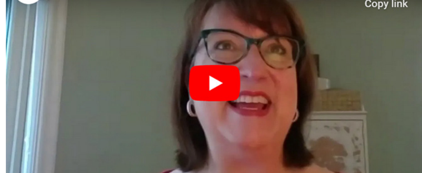
Give us an example of a trick you learned during your time as a reporter?