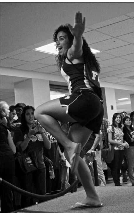
VICTORIA LYNCH/THE BEACON

The overwhelming majority of students do not wear FIU clothing or merchandise. It is a rarity to spot any in the never-ending flow of student traffic in the Graham Center's congested and raucous halls. Considering that GC is the most populous area at FIU, the lack of FIU merchandise is disturbing to