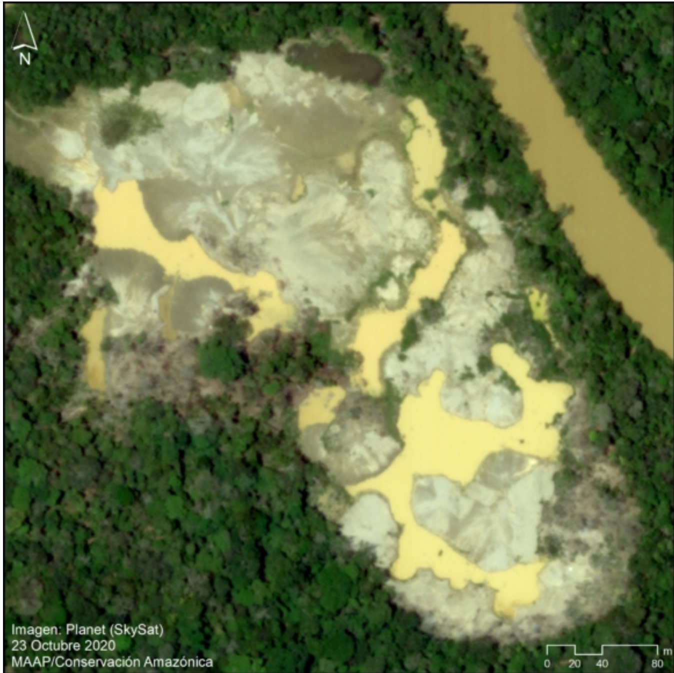
Image 1. Very high resolution image of recent gold mining deforestation along the Pariamanu River.

As part of USAID's Prevent Project (dedicated to combating environmental crimes in the Amazon), we conducted an updated analysis of illegal gold mining deforestation in the southern Peruvian Amazon .