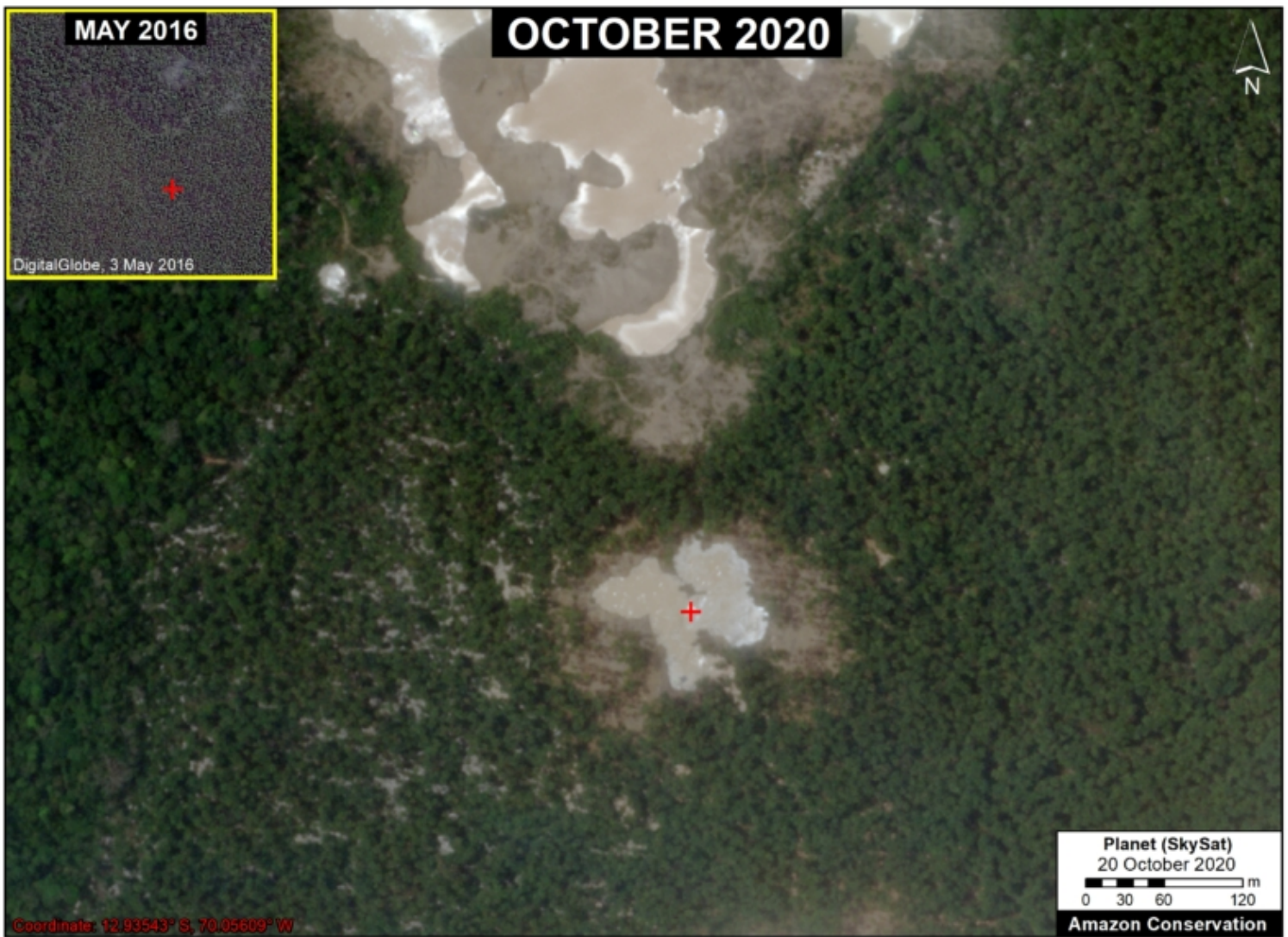
Image 4. Expansion of a new mining area in the northern part of La Pampa (Madre de Dios region).