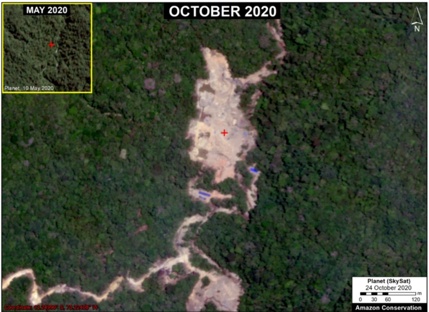
Image 5. New gold mining front along the Chaspa River (Puno region).