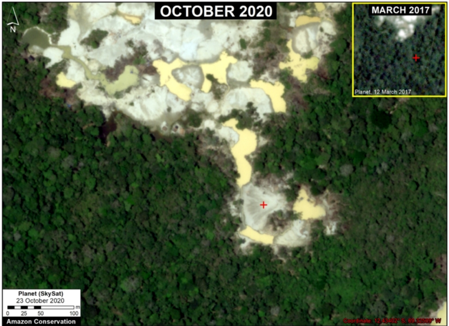
Image 3. Expansion of new gold mining areas into the primary rainforests near the Pariamanu River (Madre de Dios region). Data: Planet.