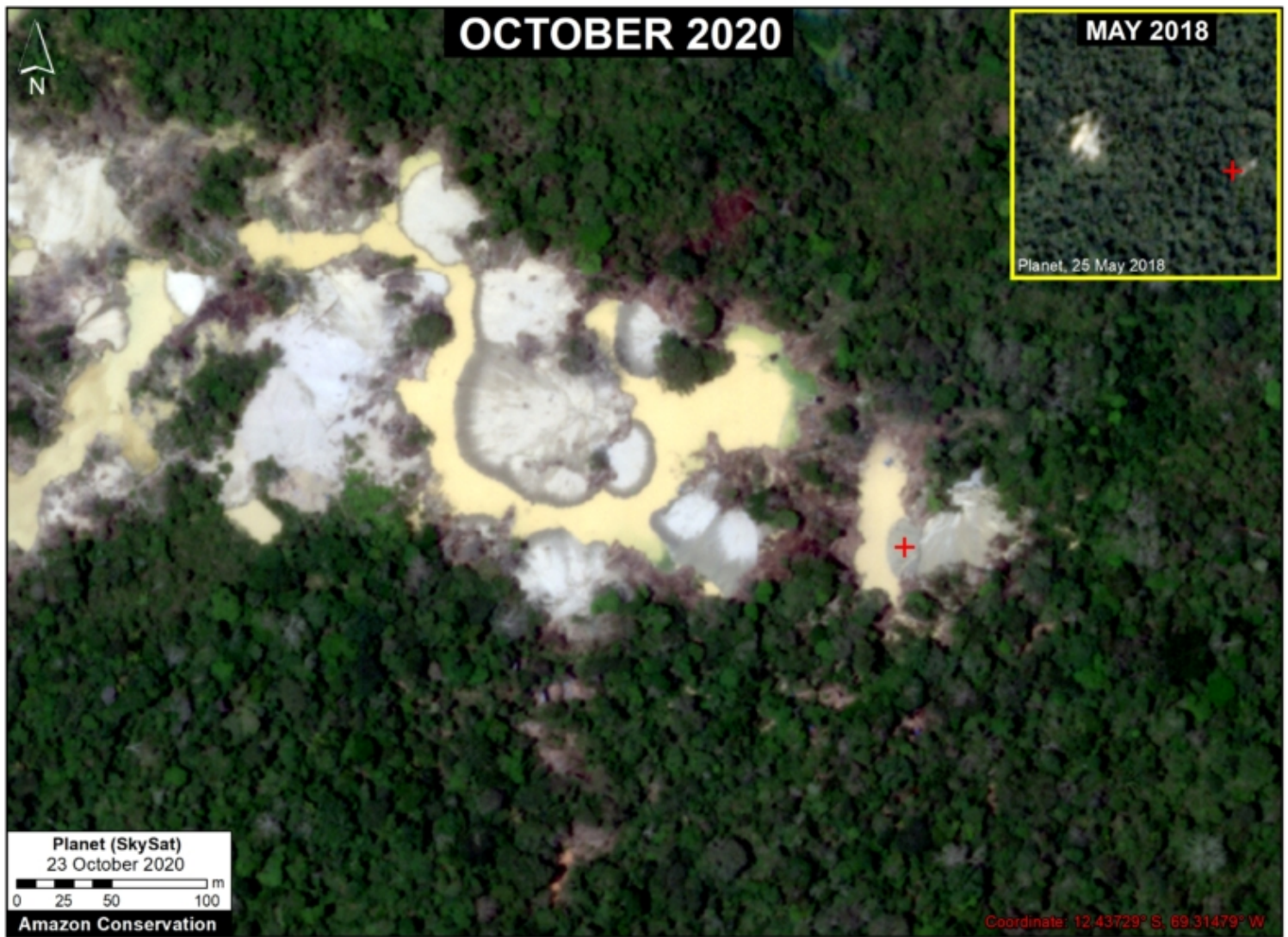
Image 2. Expansion of new gold mining areas into the primary rainforests near the Pariamanu River (Madre de Dios region). Data: Planet.