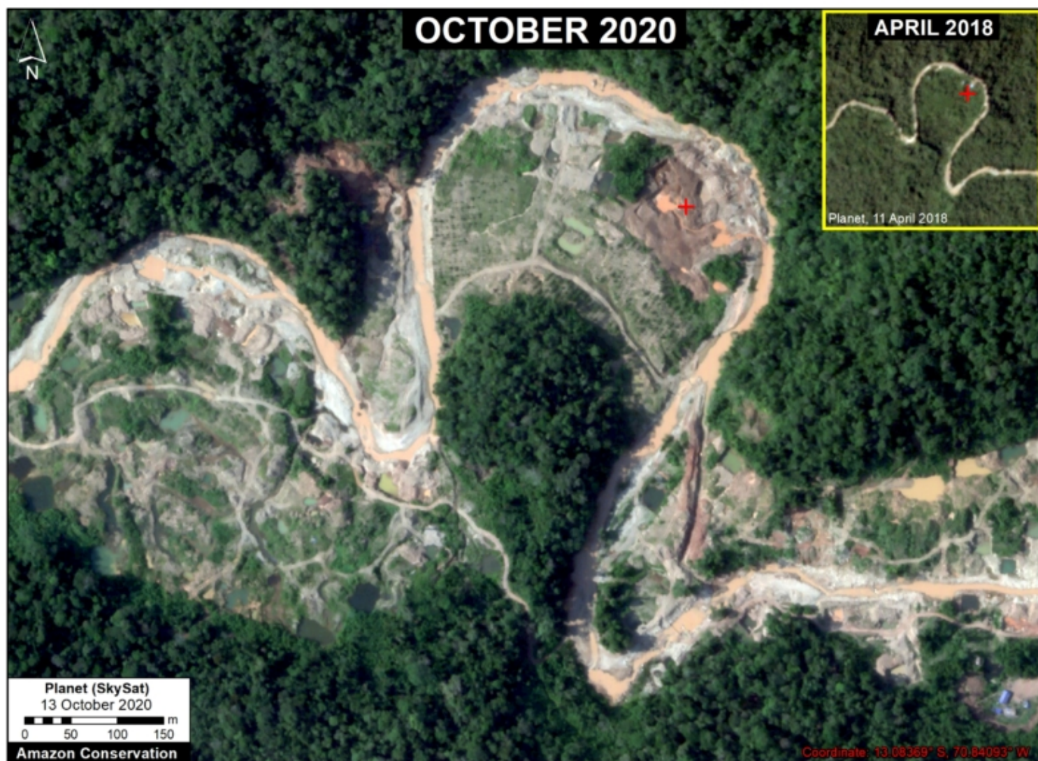
Image 6. Recent expansion of gold mining deforestation in the buffer zone of Amarakaeri Communal Reserve (Cusco region).