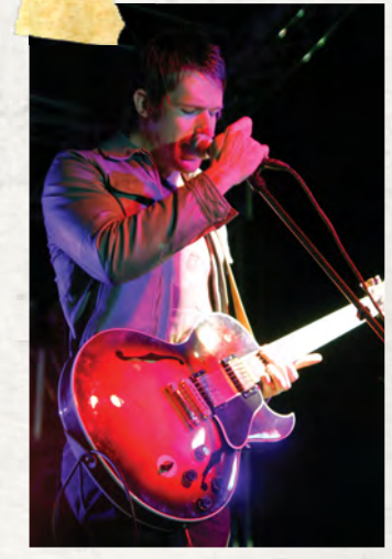
Zach Filkins of One Republic