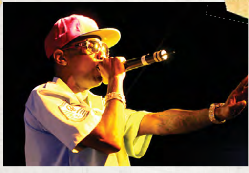
Rapper Fabolous from Brooklyn