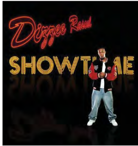
Dizzee Rascal on the cover of his 2004 album Showtime