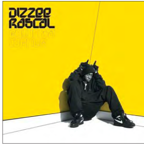
Dizzee Rascal on the cover of his 2003 album Boy in Da Corner