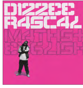
Dizzee Rascal on the cover of his 2007 album Maths + English