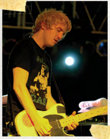
Drew Brown of OneRepublic