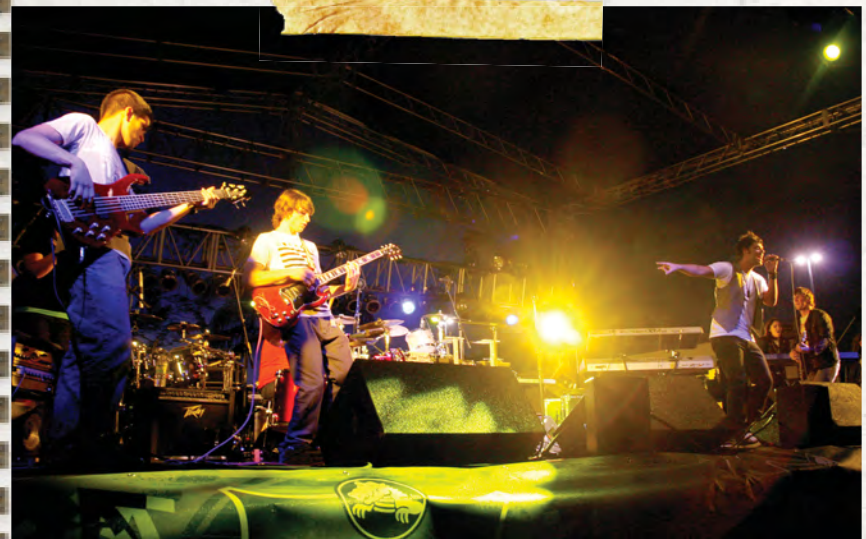
Pop/Rock group Biatti opened for One Republic