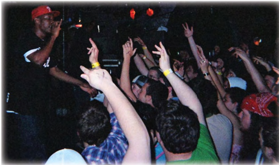
GRIME TIME: Dizzee Rascal performs in front of fans May 1, 2005 in Europe.

Fortunately, upstart underground hip-hop label Definitive Jux has released the album in CD and vinyl format stateside, giving the American audience a copy of the groundbreaking album