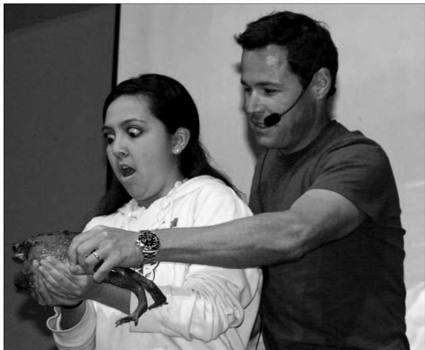
Victoria Lynch/The Beacon