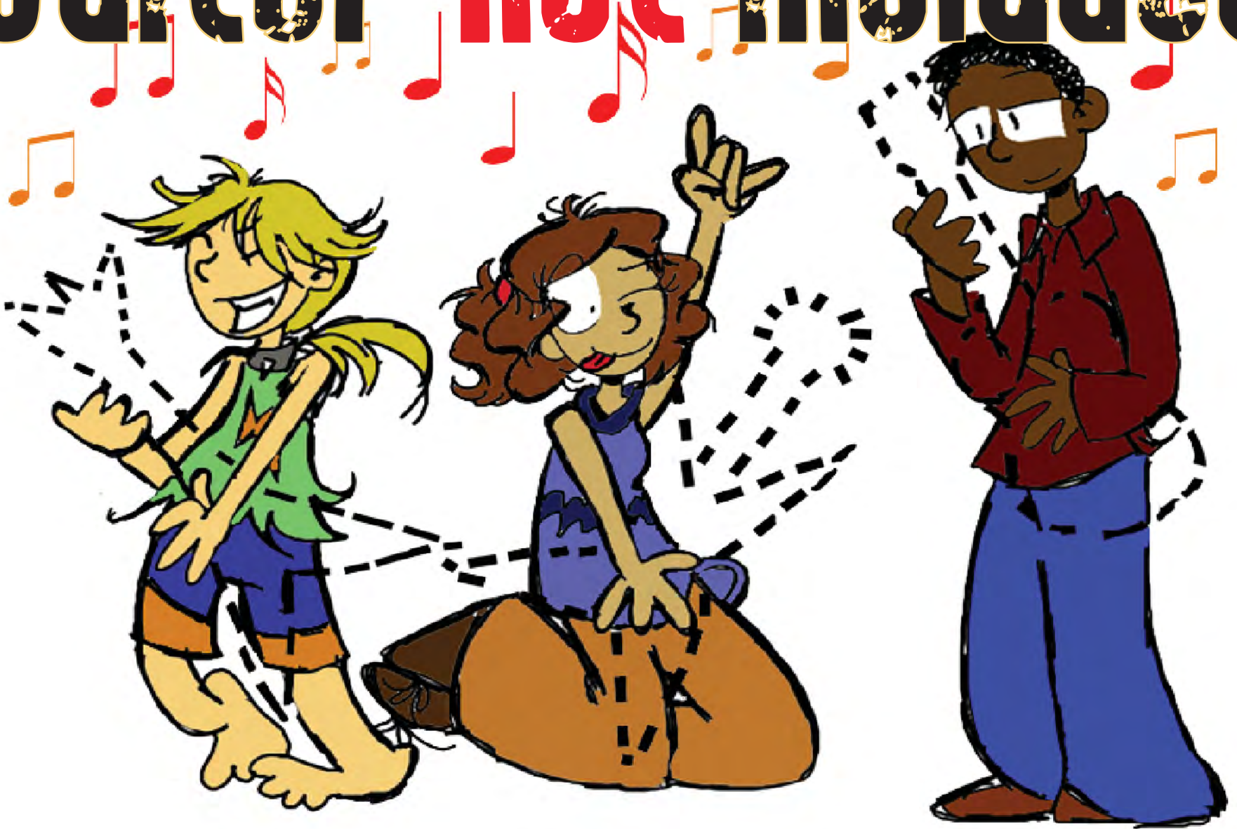
IRIS AMELIA/THE BEACON