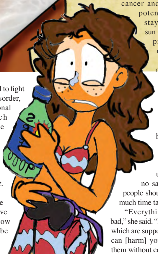
IRIS AMELIA/THE BEACON

cancer and sun spots are potential effects of staying out in the sun too long, proper precautions can reduce the risks.