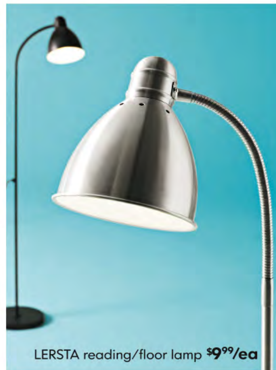
LERSTA reading/floor lamp $9 99 /ea