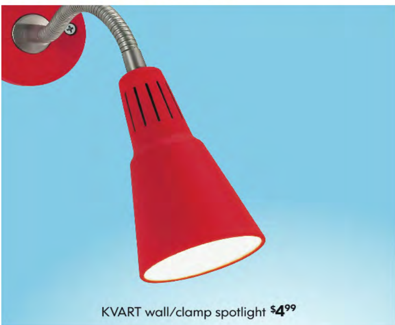
KVART wall/clamp spotlight $4 99