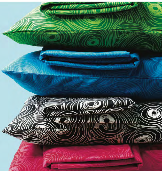
BIBBI SNURR twin quilt cover set $19 99