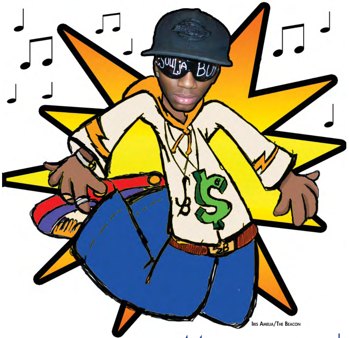
IRIS AMELIA/THE BEACON