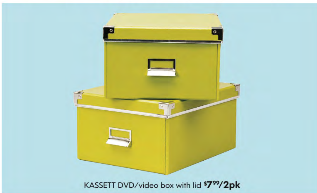
KASSETT DVD/video box with lid $7 99 /2pk

IKEA Sunrise • 151 NW 136th Ave. • I-595 West, Exit 1A; I-595 East, Exit 1B (954) 838-9292 • M-Sat: 10am-9pm, Sun: 11am-8pm